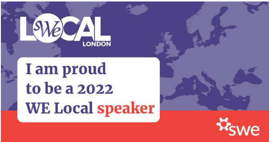
1200 px x 627 px