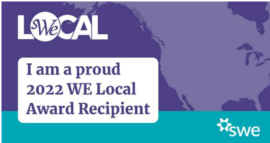
1200 px x 627 px